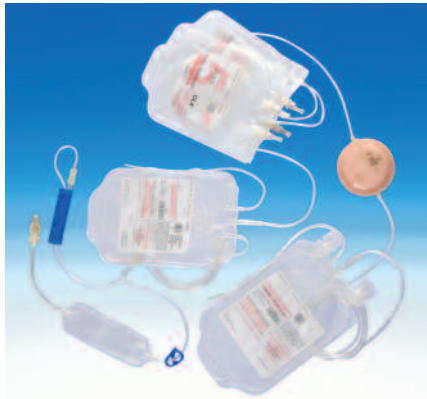
Reorder code: 129-93, Triple with CLX® platelet bags