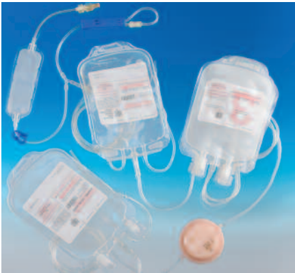
Reorder code: 129-92, Double with standard bags