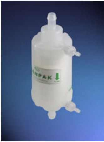
Kleenpak™ Capsules with Emflon® II Membrane