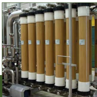
Oenoflow XL A System modules

Coupled together, the back pulse and DSC, both fully automated, provide increased system performance and longer filtration cycles.