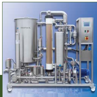
Oenoflow XL E System