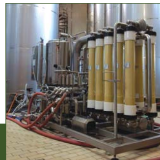
Oenoflow XL A System