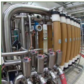
Oenoflow XL A System

Qualified Pall personnel are available to carry out scheduled maintenance service for objective verification of the operating system, ensuring optimal use.