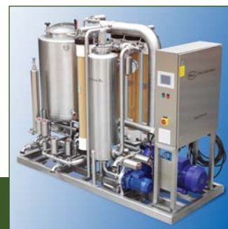
Oenoflow XL S System