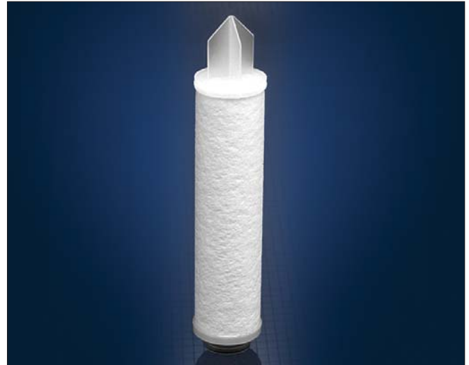
Nexis A Filter Cartridges

Please refer to the Pall website http://www.pall.com/foodandbev for a Declaration of Compliance to specific national legislation and/or regional regulatory requirements for food contact use.