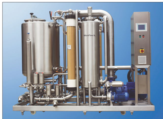
Pall Microflow XL-Brine Crossflow Microfiltration System