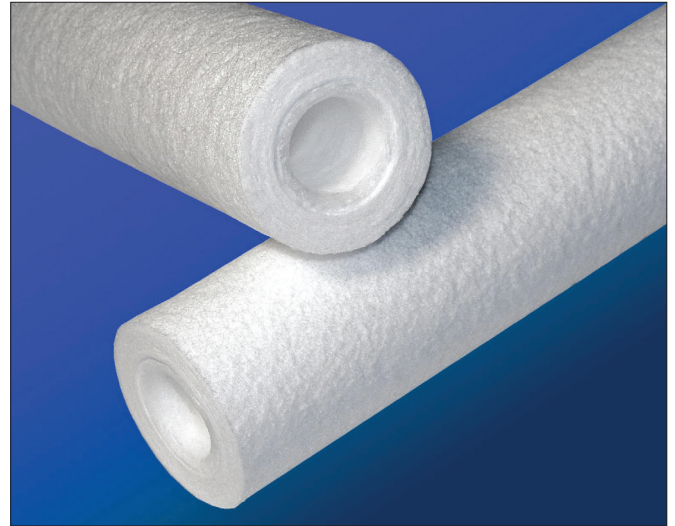
Clariss Filter Element

Please refer to the Pall website http://www.pall.com/foodandbev for a Declaration of Compliance to specific national legislation and/or regional Regulatory requirements for food contact use.